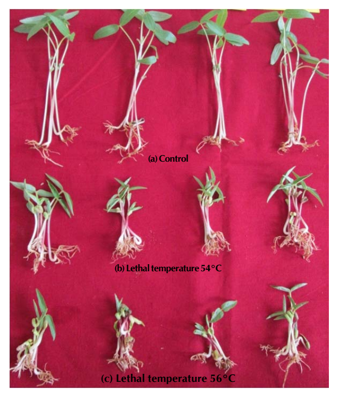
Figure 1: Performance of selected genotypes under standardization process at Control (a), Lethal temperature 54°C (b) and Lethal temperature 56°C (c) respectively

During the induction treatment, the seedlings were exposed to a gradual increase in temperature for a specific period. The temperature regimes and duration varies from crop to crop and need to be standardized. The germinated mungbean seedlings (24 hour old mungbean seedlings) were subjected to gradually increasing temperatures for a period of five hours.