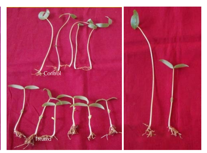
Tolerant genotype (LGG 410)

The genotypes showed high genetic variability for per cent survival of seedlings, per cent reduction in root and shoot